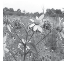
Limestone Park

Birmingham Audubon needs your knowledge, wisdom, and passion to continue the legacy and the tradition of service that has always been Birmingham Audubon.