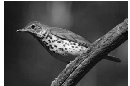
Wood thrush

I was very impressed by the commitment shown by this local chapter to a conservation project that integrated local, national, and international partners. I look forward to exploring various ideas about how Birmingham Audubon can follow this model to achieve similar accomplishments. To learn more about this wood thrush project, go to http://www.forsythaudubon.org/Conservation/WoodThrush.aspx