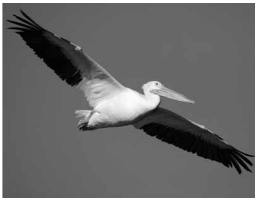
American White Pelican

Please, send sightings for October Flicker Flashes at least five days before the September 1, deadline to Ann Miller, 520 Yorkshire Drive, Birmingham, Al. 35209 annmiller520@aol.com