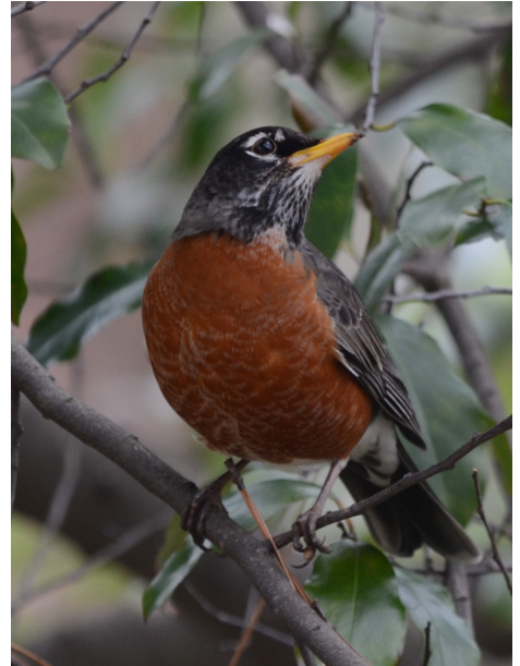
The Russ Bailey Memorial Walk is a great way to learn about birding at one of Birmingham's premier nature preserves.