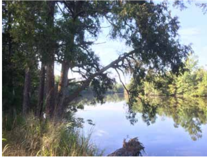
Perdido River

Over the past six months, there have been some important new additions of land to various State Parks by the Forever Wild Program. In October 2016, some 640 acres of rugged forestland were added to Guntersville State Park in