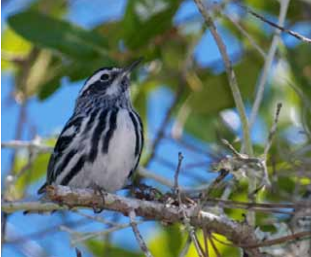
Not quite Kodachrome . . .

By the time the current issue of Flicker Flashes ends up in your mailboxes, this small neotropical migrant will already be clinging to bark and snapping up insects throughout Alabama; a breeder in the state's northern regions, it's one of the earlier spring arrivals from Central and northern South America. Still need a hint? Consider the bird's unusual, nuthatch-like behavior—when it's out foraging, you're as likely to see it upside down as right-side up. In other words, it's a strange bird, even within its famously colorful family!