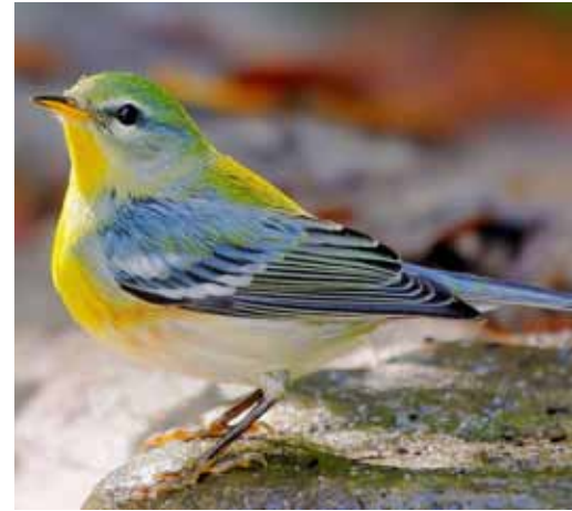
Northern parula - A bird we might see on this trip.

Trip leader: Greg Harber, 208-807-8055 (day of trip only, please).