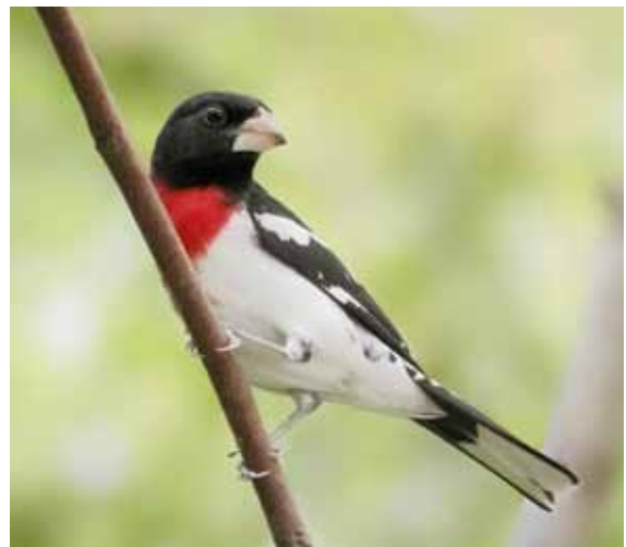
Rose-breasted Grosbeak

This all-day count will cover parts of Jefferson, Shelby, St. Clair and Blount counties, and we'll need as many participants as possible to adequately cover the area. Even though this is an all-day count, you may join a party for any part of the day if you only have a limited amount of time. It is essential though that you make arrangements now to join a party on count day. Feel free to call me at 251-2133 for the names and phone numbers of party leaders in your area. Or, you may wish to count the birds at your feeders and call or email your report to me later. Rose-breasted Grosbeaks will surely reward those who take the time to watch at home!