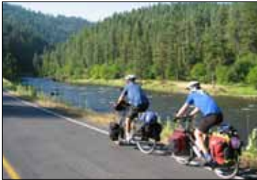
Idaho, Lochsa River