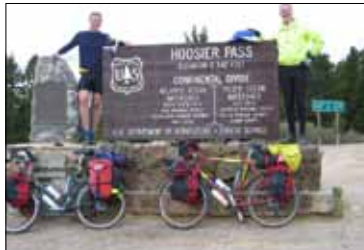
Hoosier Pass, Colorado

Birmingham Audubon hosts a nationally-recognized speaker each year during the annual banquet for members,