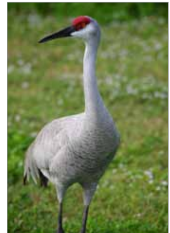
Sandhill crane